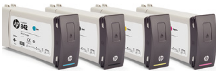
8 (2 x 775-ml per color with auto-switch)

The HP PageWide XL 8000 Printer includes a stationary 40-inch (101.6-cm) printbar that spans the whole printing width. As paper moves under the printbar, the entire page is printed in one pass, enabling very high printing speeds.